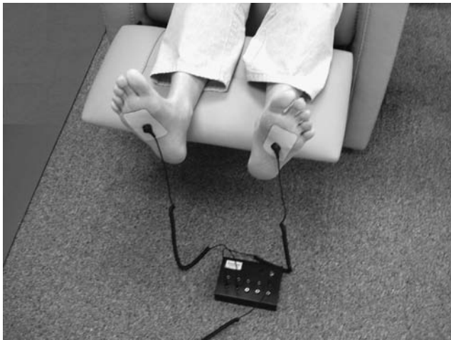
FIG. 1. Grounding system showing patches, wires, and box connecting to a ground rod planted outside through a switch (not shown) and a fuse (not shown). Similar patches and wires from the hands were also connected to the box to ground the hands.