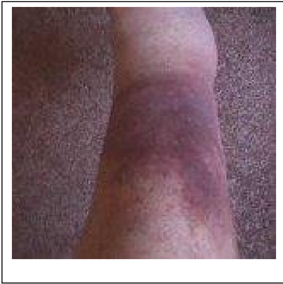
Before: Diabetes lower leg