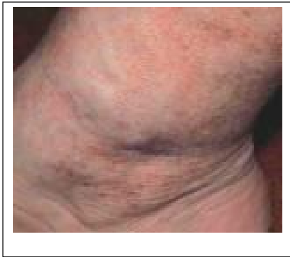
Before: arthritic inflammation

(Photo above shows subject with chronic inflammation in knee. Conductive patch placed on subject's knee. Ground rod (photo at right) placed directly in the earth.)