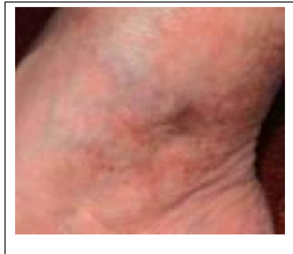
After: 7 nights using ground patch

(Subject (age 65) with chronic pain and inflammation in ankle, (photo at left), reported that significant relief from pain occurred within minutes of grounding via the patch. After grounding for 7 nights, (photo at right), inflammation disappeared and circulation significantly improved.)