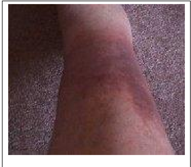
After: 7 nights using ground plate

Subject (age 47) with Type II diabetes (photo at left). After 3 nights of grounding, subject reported significant relief from pain of neuro-pathy and improved sleep. After 7 nights (photo at right), reduction in redness and inflammation demonstrated significant improvement in circulation. Subject also reported improvement in energy levels and overall sense of "increased well-being".